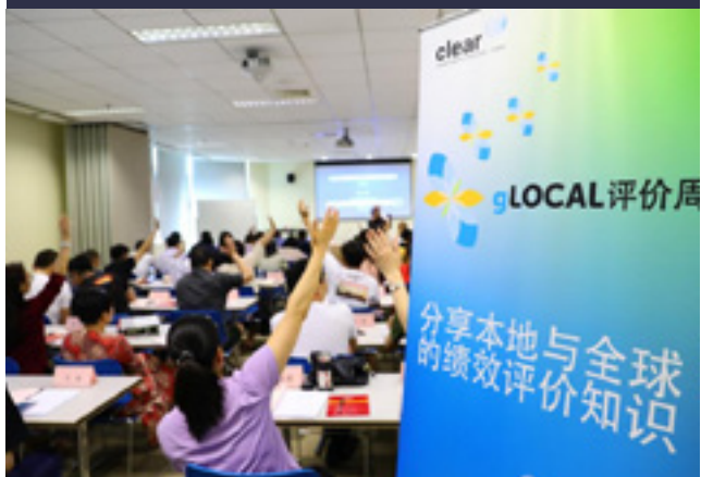
^ Photos from gLOCAL Evaluation Week 2019

Everyone is welcome. All events are free and open to the public.