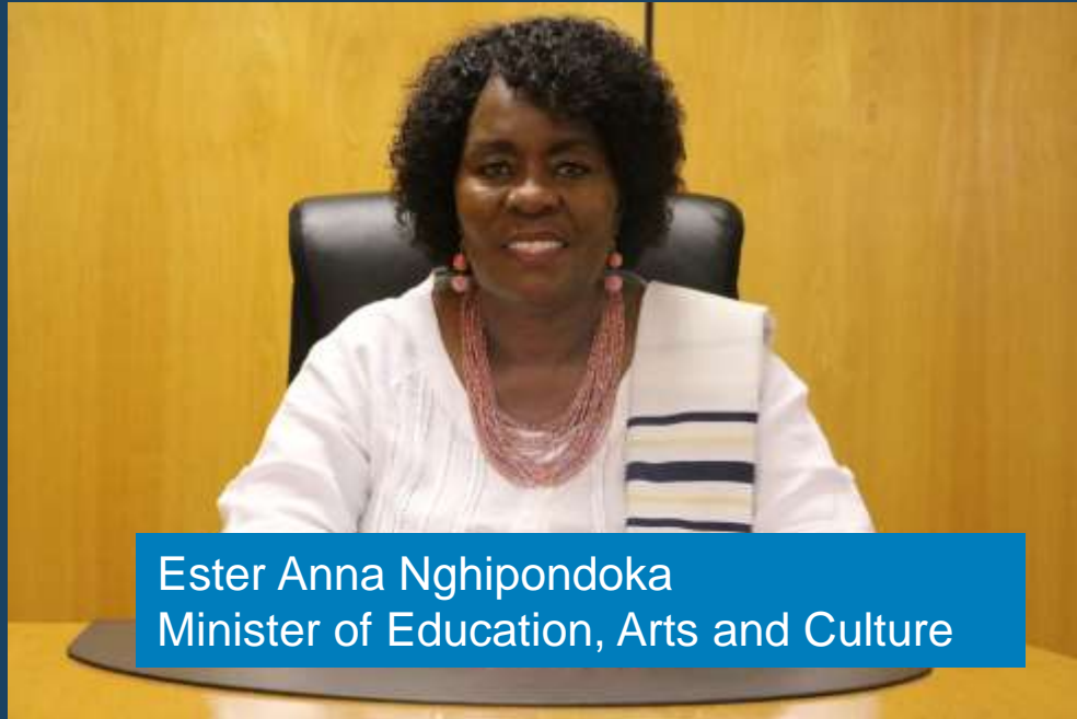
Ester Anna Nghipondoka Minister of Education, Arts and Culture