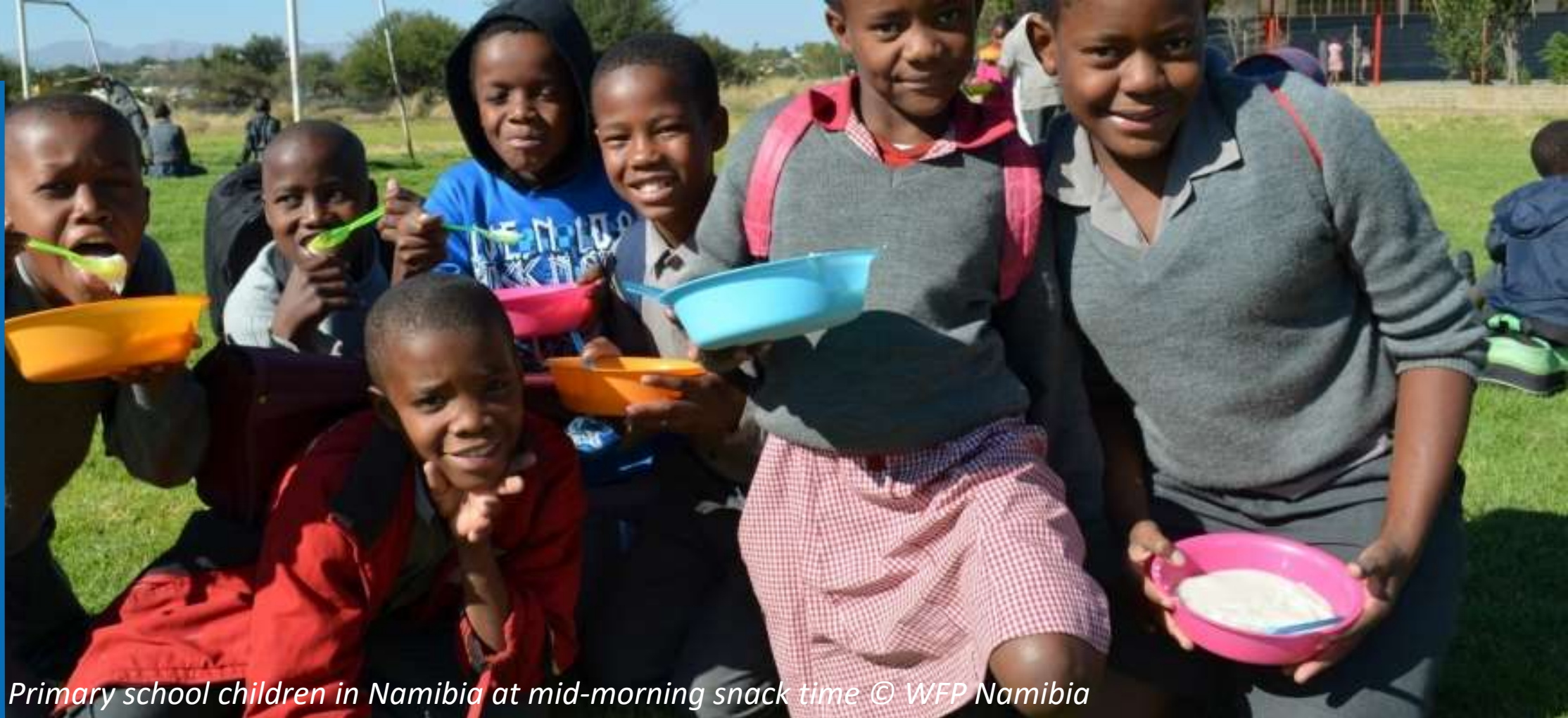
Primary school children in Namibia at mid-morning snack time